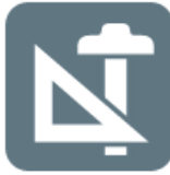
Blank Retail Floor Plan